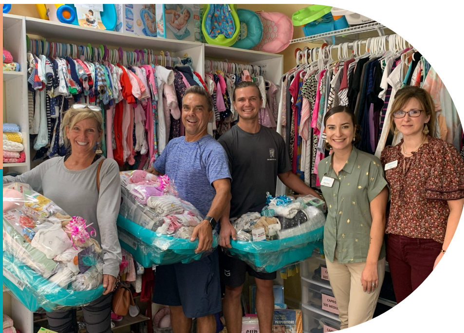
Pictured: Small Group from Eleven22 delivering Layette Sets to our Clay County Center!

The following pages contain more information on each type of gift set to help you get started.