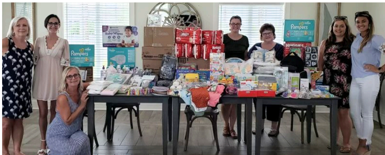
Pictured: Baby Shower donations by First Coast Baptist Church, Riverwood's Women's Bible Study, and Eleven22