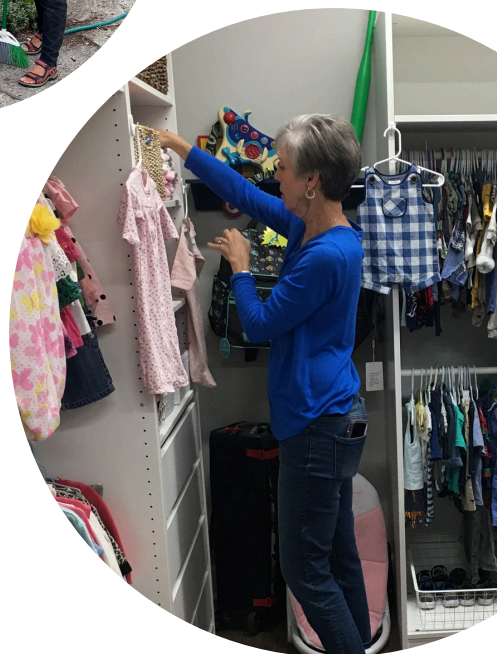
Pictured: Fruit Cove Baptist, Fort Caroline Baptist, and North Jax Baptist Church work days!