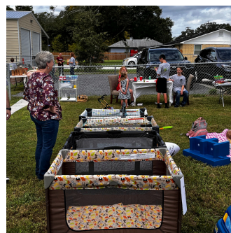
Pictured: Clay County Family Fun Day held by Hibernia Baptist Church